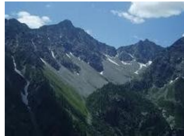
Palavar Les Flots

Where Ailfroide How Long? 400m 12 pitches Rock? Granite Grade(UK)? V.S.5a Gear? Well bolted; quick draws and 2 50m ropes Approach? 25 mins from upper part of camp site Nature of climb? Takes the left edge of a huge corner which culminates in a pointy top. It is never too