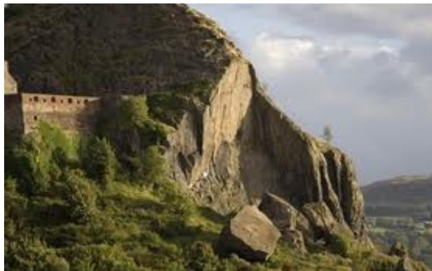
Rhapsody on Dumbarton Rock

In April 2006 he established the climb 'Rhapsody on Dumbarton Rock which, at the grade of E11 7a, was possibly the hardest traditional climbing route in the world at the